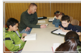
MVBC strives to serve one another with the spiritual gifts God has graciously given

Women's Ministry is focused on Bible Study, service, and fellowship. The ladies provide meals for families, host baby and bridal showers, send cards, and work together in many ways to serve the Lord. They study at various studies and enjoy special fellowship times through retreats, luncheons and special events throughout the year.