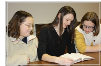
At 180° Junior and Senior High students enjoy serious study, prayer and play

Youth Ministry—FYI (Family Youth Interaction) is for students in the 7th to 12th grade and meets Sunday mornings for Bible Study and has monthly activities for the whole family. Check the monthly calendar in the Olive Branch or the Sunday bulletin to see when the next event is scheduled.