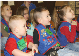
Ministering to children is particularly precious to Magic Valley Bible Church

Awana clubs (3 years - 6th grade) offers children an opportunity to enjoy Game, Handbook and Council Times where they learn about, and memorize God's word. The special games, uniforms and events provide a unique environment for kids to, "reach boys and girls with the Gospel of Christ" and is a place where we can, "train them to serve Him."